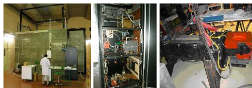
Fig. 2 – Linac: bunker; modulator; accelerating structure and electron/photon beam exit (270° loop).

The Linac (Fig. 2) can operate both in electron and in photon mode and deliver an energy comprised between 4 and 12 MeV. A magnetron working at a frequency of about 3 GHz and triggered between 10 and 300 Hz delivers pulses of several ms.